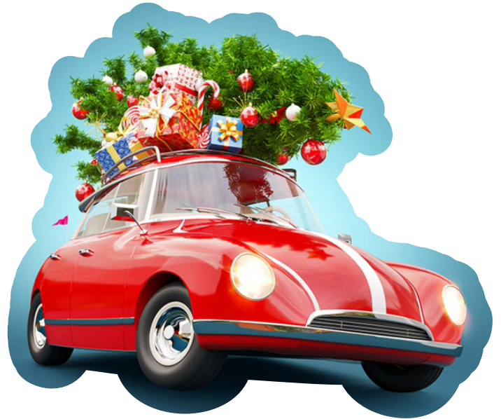
DIGITAL INVITE 120 MICRON