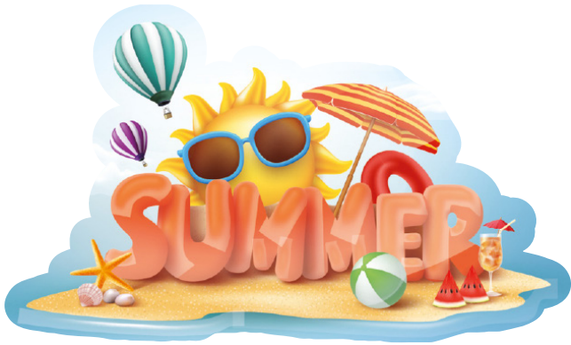
DIGITAL INVITE LIGHT 90 MICRON